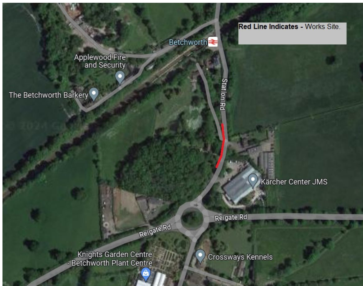
Extent and location of planned drainage scheme on Station Road, Betchworth.